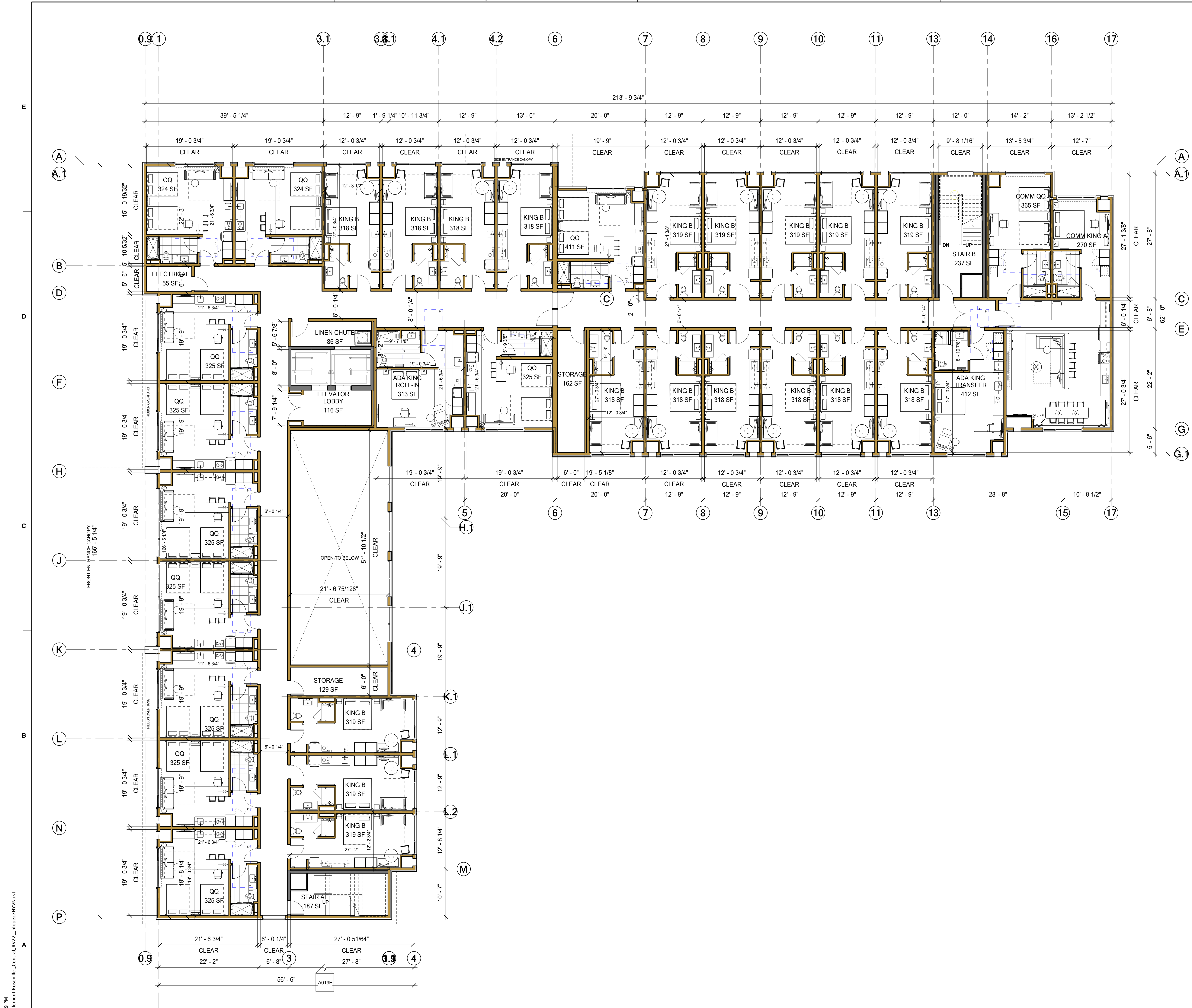
1 FLOOR PLAN - LEVEL 2 Element